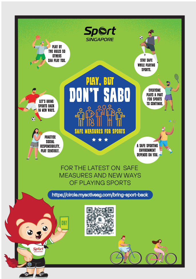
a) Size: A3