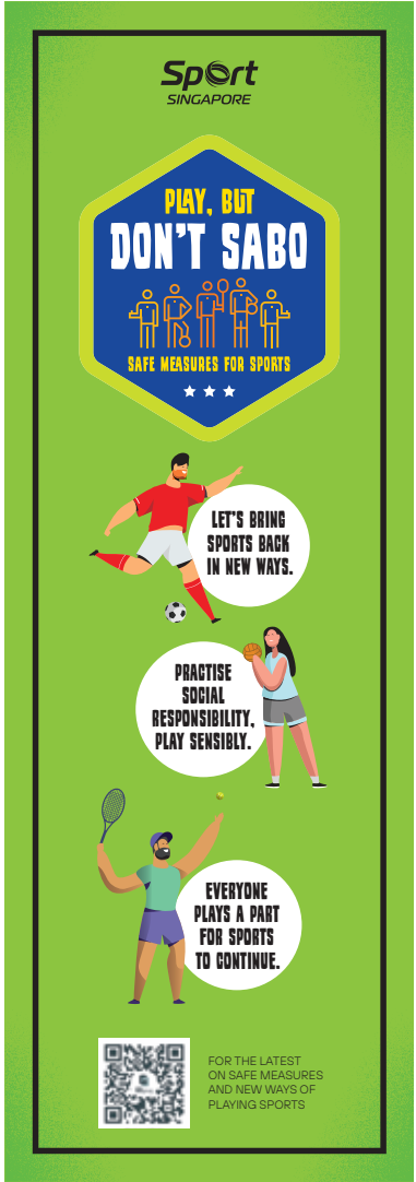
a) Size: 1m (W) x 3m (H)