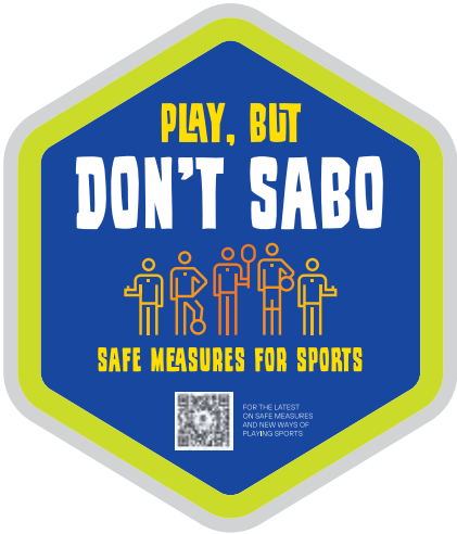
Decal application on glass windows